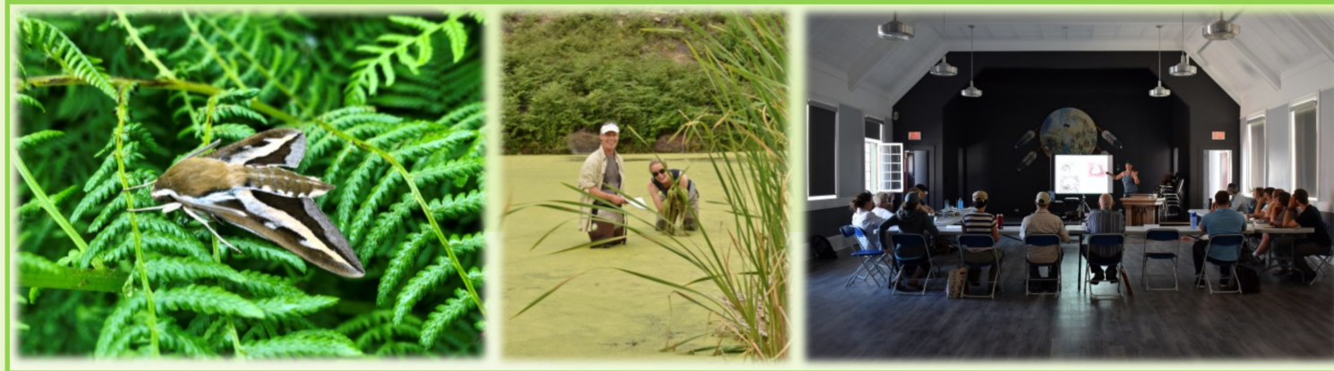
Left: Bedstraw hawk-moth spotted in-field. Middle: Aquatic vegetation ID in Rossland. Right: Kamloops participants learning about a Spadefoot toad, a local at-risk species.