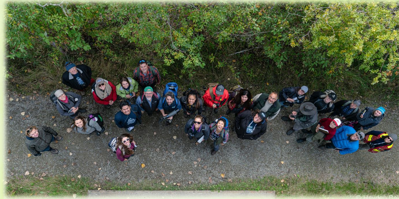
Image of the Wetland Institute participants from one of the observation towers at Creston Valley Wildlife Management Area

Our flagship workshop, the Wetlands Institute accepts applicants from across the province who have wetland projects in their respective communities, and provides them with the skills necessary to complete them. The 17th Annual Wetlands Institute was hosted in two Kootenay communities: Creston and Rossland. The participants were diverse, coming from various backgrounds such as NGO, Municipal Government, Provincial Government, Environmental Consulting, and the Resource Industry. A portion of this training was delivered by 18 experts from various fields. Just a few of the topics covered included: