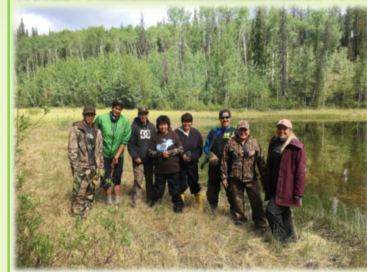
Wetlands training conducted with the Kwadacha Nation focusing on classification and health assessments of wetlands