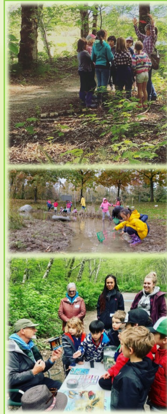
Top & Bottom: In Squamish, youth are learning about the importance of salmon, Middle: Chantrelle Elementary students looking for invertebrates,

Contact wetlands@bcwf.bc.ca for more details