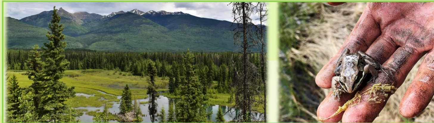
Left: Beautiful wetland in Tsay Keh Dene, Right: Pacific Tree Frog found by a participant

Map our Marshes is a 1-2 day crash course that teaches the value and tools of community mapping and inventory of wetlands. Unless wetlands are identified and mapped, they could go unrecognized and be inadvertently destroyed by agriculture, development, ranching, or invasive species.