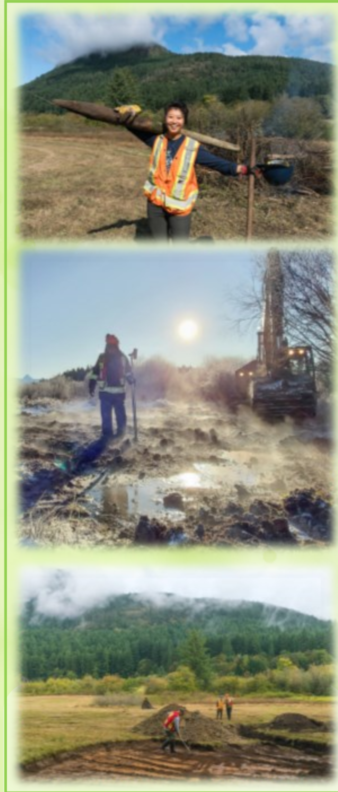
Top & Bottom: WEP team members restoring a wetland at Xwaaqw'um, Middle: Wetland Restoration Specialist, Robin Annschild, surveying Sparrowhawk site

Alongside the restoration projects explored during the Wetland Institute, the Wetlands Education Program continued to work on wetland restoration projects throughout 2019. Across 7 sites, BCWF was able to restore almost 70 hectares of wetland and floodplain habitat across BC for the benefit of wildlife and humans alike. Two restoration initiatives are described below.