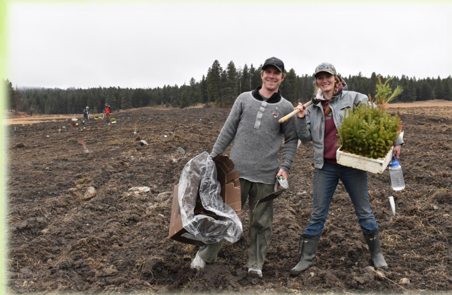
Planting upland and riparian plants at Earl Ranch in Newgate, BC. These plants will prevent soil erosion and become an important food source for elk and deer.