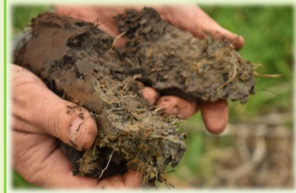
A Wetlandkeepers participant getting her hands dirty during a soil sampling exercise.

Over 2.5 days, these hands-on workshops educate participants about wetland conservation and provides them with technical skills to steward the wetlands in their own backyards. Each course is uniquely tailored to the host community, and topics such as wetland classification, mapping, soil sampling, and vegetation identification are part of the base structure of this course.